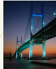
Building Solid Relationships That Serve Tomorrow!

Our attitude demands that we impart a distinct impression making a positive impact in the experience of those we serve.